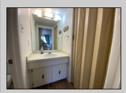
9105 Atlantic Margate, NJ 08402