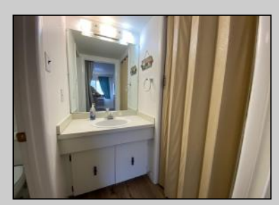
9105 Atlantic Margate, NJ 08402