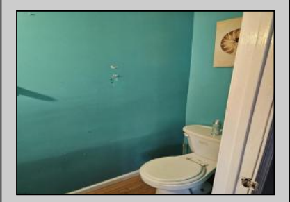
4815 Anglesey Mays Landing, NJ 08330