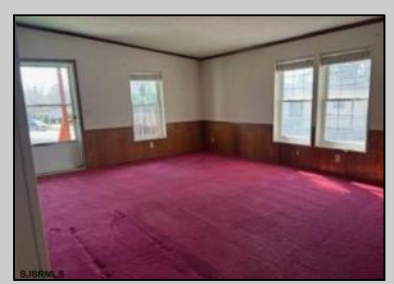
5 Clark Mays Landing, NJ 08330