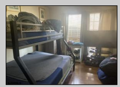
127 Iroquois Galloway Township, NJ 08205