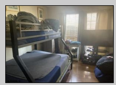
127 Iroquois Galloway Township, NJ 08205