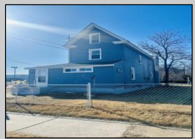
27 3rd St Pleasantville, NJ 08232