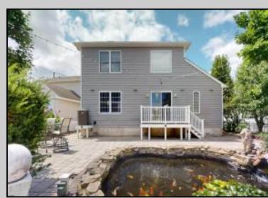
42 Kirkwood Brigantine, NJ 08203