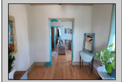
557 Cincinnati Egg Harbor City, NJ 08215