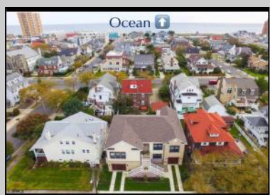
5405 Winchester Ventnor, NJ 08406