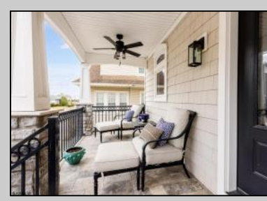
28 Huntington Margate, NJ 08402