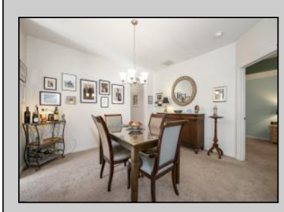
658 London Court li Egg Harbor Township, NJ 08234