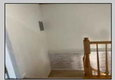
136 Pine Knoll Cir Mays Landing, NJ 08330