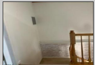
136 Pine Knoll Cir Mays Landing, NJ 08330