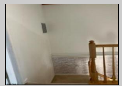
136 Pine Knoll Cir Mays Landing, NJ 08330