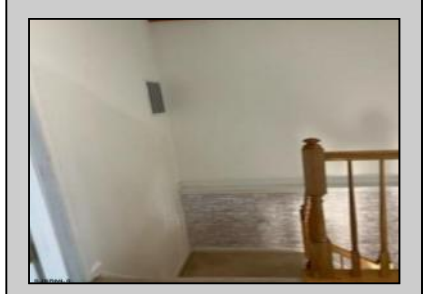
136 Pine Knoll Cir Mays Landing, NJ 08330