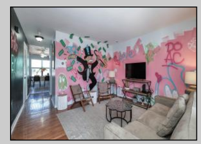
314 Massachusetts Atlantic City, NJ 08401