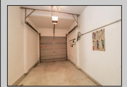
26 Barkentine Atlantic City, NJ 08401