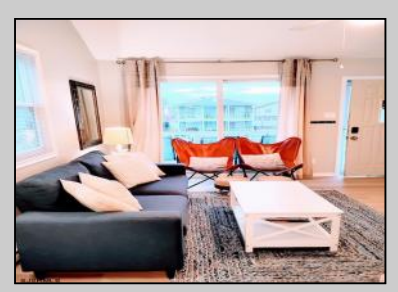
111 4th St S #B Brigantine, NJ 08203