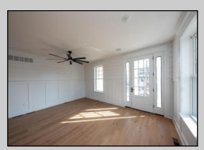
634 Ocean Avenue Ocean City, NJ 08226