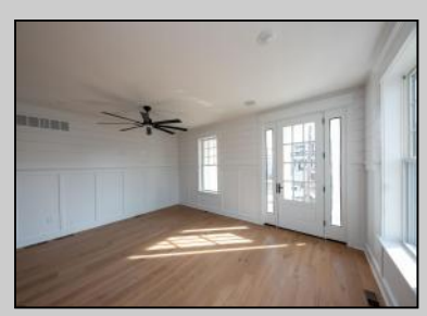
634 Ocean Avenue Ocean City, NJ 08226