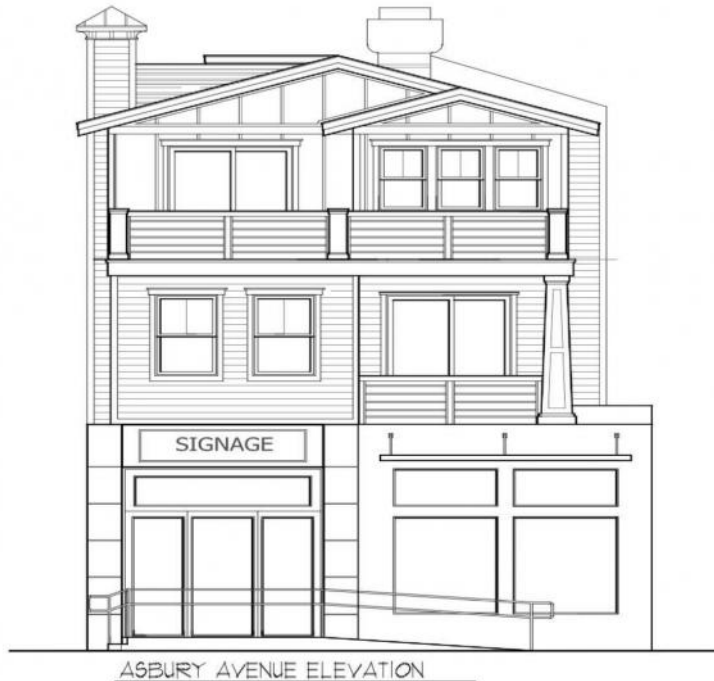
ASBURY AVENUE ELEVATION