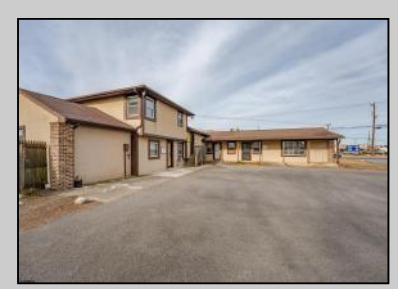
98 New Somers Point, NJ 08244