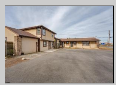
98 New Somers Point, NJ 08244