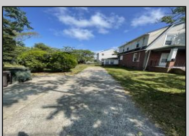
1511 Madison Venice Park, NJ 08401