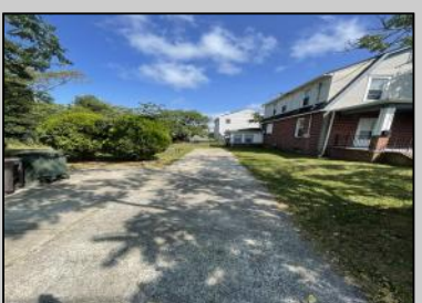
1511 Madison Venice Park, NJ 08401