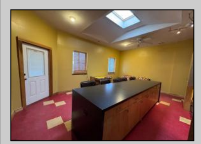
1 1/2 Newport Ventnor, NJ 08406