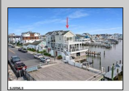
112 10th St Ocean City, NJ 08226