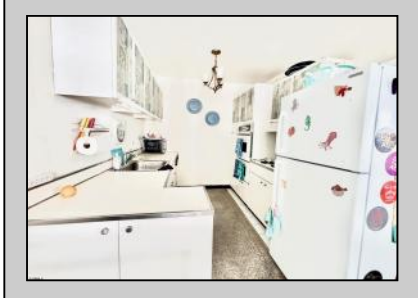
101 Plaza Place Atlantic City, NJ 08401