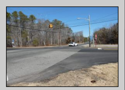
00 ALOE Galloway Township, NJ 08205