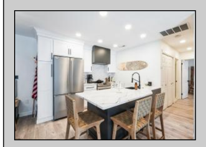
308 Harbour Cove Somers Point, NJ 08244