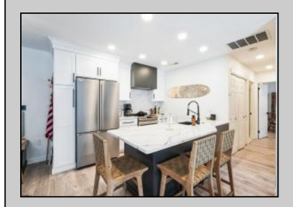
308 Harbour Cove Somers Point, NJ 08244