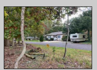
502 Holly Galloway Township, NJ 08205