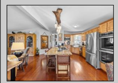
273 Greenbriar Mays Landing, NJ 08330