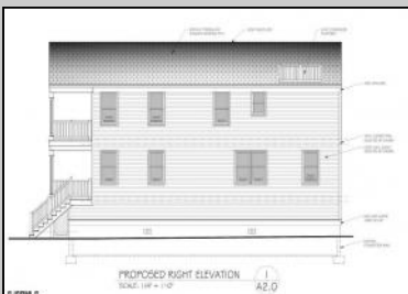
PROPOSED RIGHT ELEVATION SCALE: 1/4" = 1'-0"