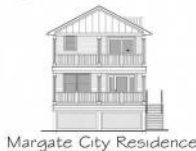
Margate City Residence

Addition/ Alterations to: 202 N Fredericksburg Ave Margate City, NJ 08402