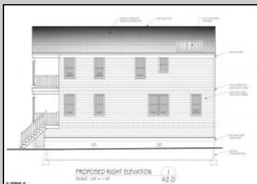
PROPOSED RIGHT ELEVATION SCALE: 1/4" = 1'-0"