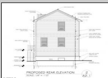
PROPOSED REAR ELEVATION SCALE: 1/4" = 1'-0"