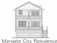
Margate City Residence

Addition/ Alterations to: 202 N Fredericksburg Ave Margate City, NJ 08402