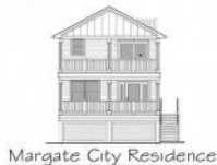
Margate City Residence

Addition/ Alterations to: 202 N Fredericksburg Ave Margate City, NJ 08402