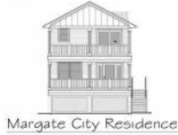
Margate City Residence

Addition/ Alterations to: 202 N Fredericksburg Ave Margate City, NJ 08402