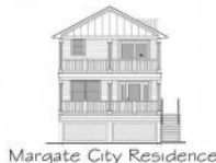
Margate City Residence

Addition/ Alterations to: 202 N Fredericksburg Ave Margate City, NJ 08402