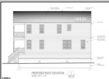
PROPOSED RIGHT ELEVATION SCALE: 1/4" = 1'-0"