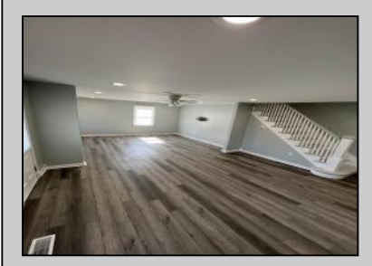
1416 13th Dorothy, NJ 08317