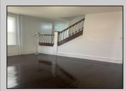
213 Montpelier Atlantic City, NJ 08401