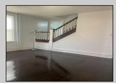
213 Montpelier Atlantic City, NJ 08401