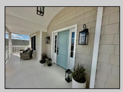
702 Sterling Pl Brigantine, NJ 08203