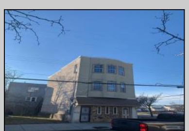
46 Maryland Atlantic City, NJ 08401