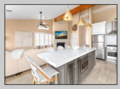
4135 Asbury Ocean City, NJ 08226