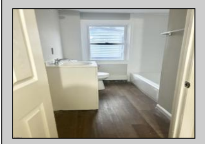
1722 Logan Atlantic City, NJ 08401