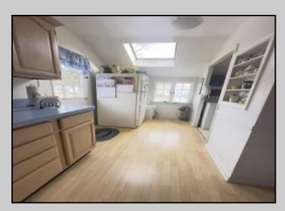
133 Colwick Dr Somers Point, NJ 08244