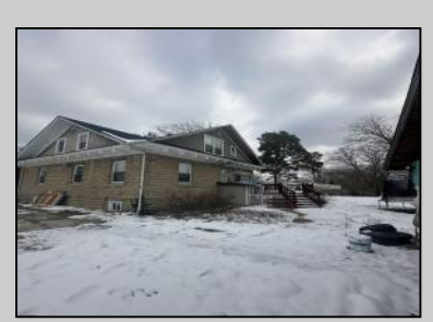
711 Seneca Ave Pleasantville, NJ 08232