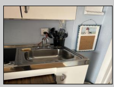
840 Ocean Ocean City, NJ 08226